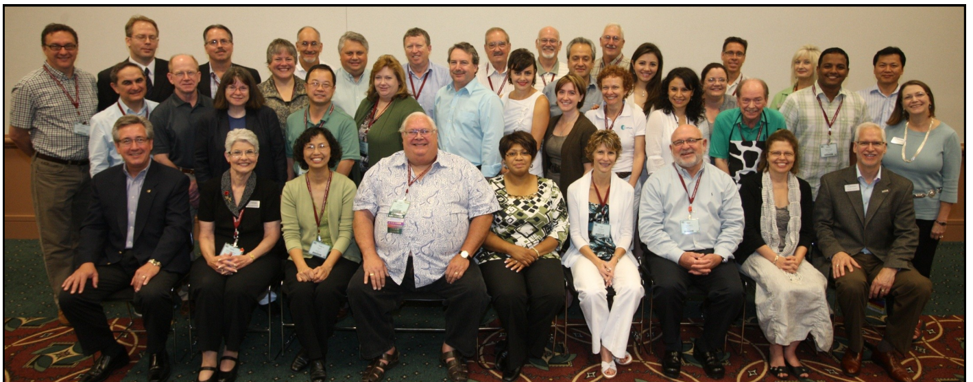
IAFP 2011 Affiliate Council meeting